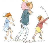
We're Going on a Bear Hunt Michael Rosen Helen Oxenbury

Christmas will be a time to talk about family customs and to learn about other festival of lights around the world. We will perform a Nativity play in the very last week of term and we hope you will come and enjoy our musical celebration.