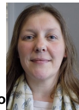
Nursery Lead Practitioner